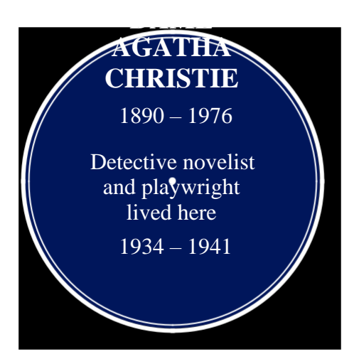
7 Bruce Grove, Tottenham, London

58 Sheffield Terrace, Holland Park, London